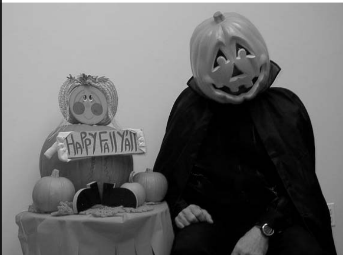
Jack-O-Lantern enjoys “Spirit Special 2003.” “Spirit Special” is as an alternative to traditional Halloween activities and is held at Sterling Park Baptist Church. This year’s event promises to be just as c-oooo-l as last year.

Donations of candy prior to the party would be most appreciated! Please drop your candy in the decorated box in the vestibule.